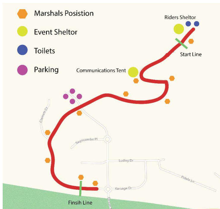
Figure 2: Satellite view of the Ocean Ridge subdivision showing location of event shelters and marshals positioning

The set up of the event will be very similar to previous years with the only alteration being the addition of two competitor/spectator shelters, one at the very top of the course and one on the first corner of the track. These will provide the needed sun shelter as asked for in feedback from the previous events.