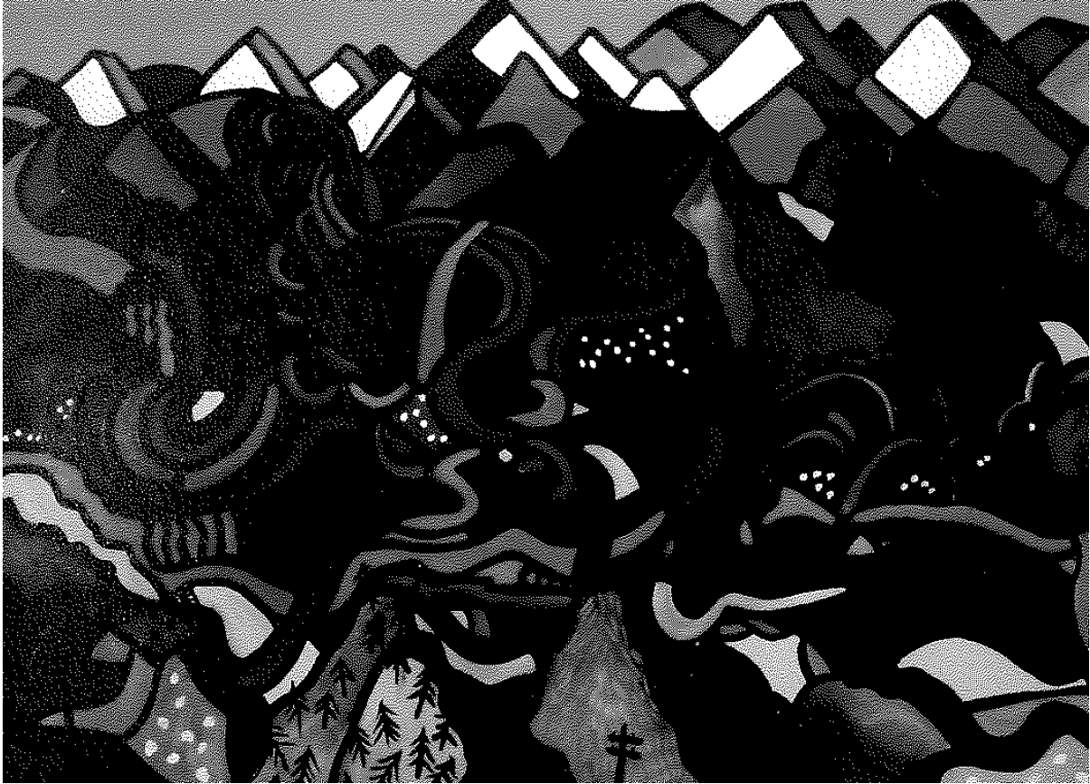
Figure 3: Sketch showing style of proposed mural

Recommendation: That the request by Jean Laming to paint a mural on the West End Toilets be approved.