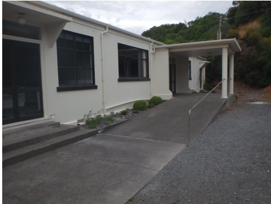
Fig 2 Access to rear of Building

Recommendation: That the installation of disabled access to the Memorial Hall be via the front of the building at an estimated cost of $8,600.