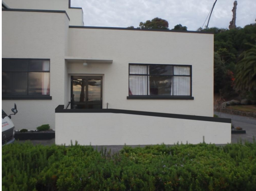
Fig 1 Access to front of Building