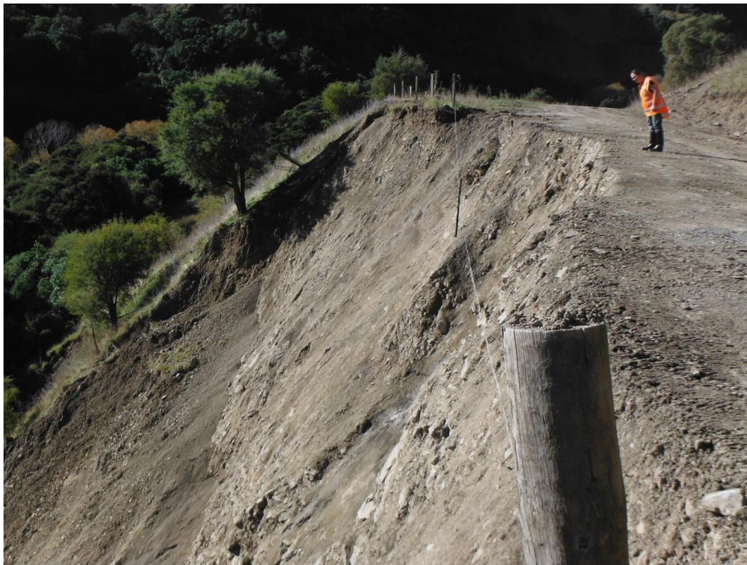
Figure 1: Greens Slip Kekerengu Valley Road

The repair work is being completed as resources allow. Given the damage that has occurred elsewhere in the same event and that other centres have a significant call on the Canterbury contractors not all repairs will be able to be completed immediately.