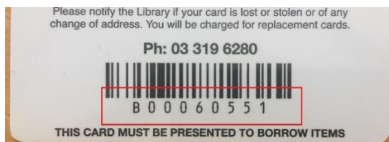
Figure 2 Library card membership number