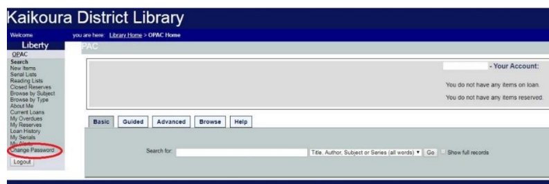
Figure 3 Change password