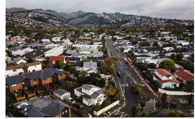
Built environment / He taiao kua hangahanga whare