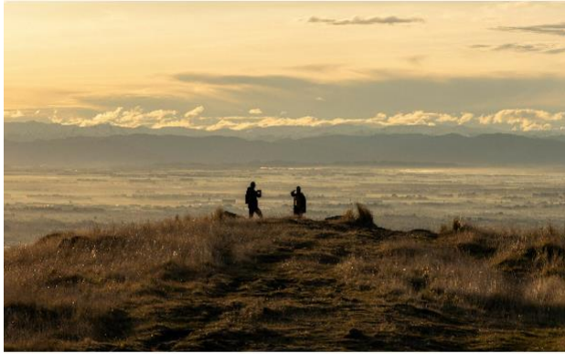
Air / Hau takiwā