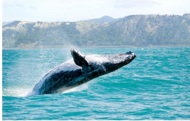
Coast / Takutai