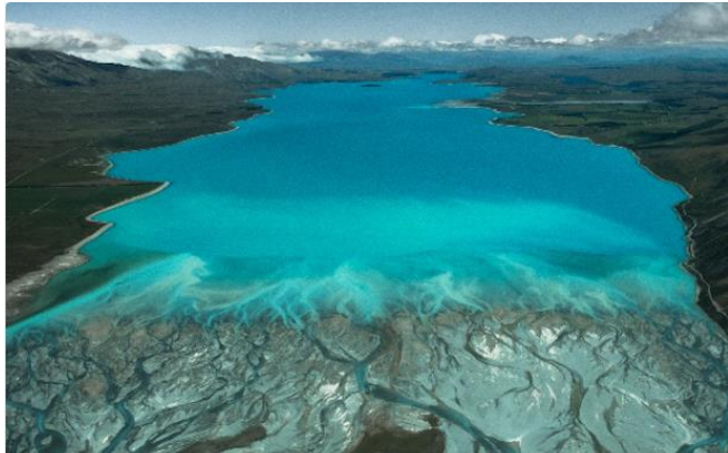
Water / Wai