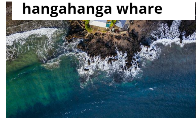
Climate change / Te huringa āhuarangi