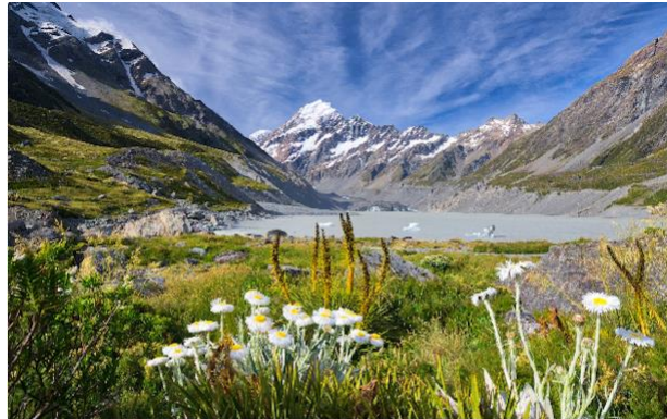
Land / Whenua