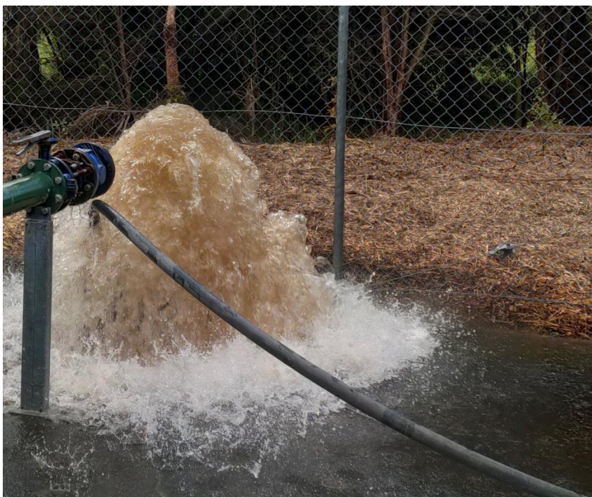
Ocean Ridge Bore Flushing

KDC engaged a drilling company to work with IWK to clean out the Ocean Ridge supply bores, which were producing increasing amounts of fine iron-coloured sediment. This was not a health risk but could have become an aesthetic issue if it was not dealt with. The image below shows the flushing operation, which used pulses of compressed air to lift the water column, then allowed the water to backflow out into the surrounding gravel to loosen the sediment. IWK has also cleaned out the Ocean Ridge reservoir.